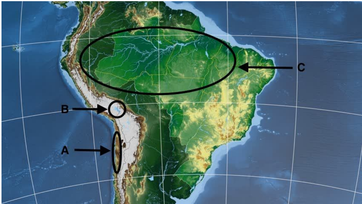
Satellite image of part of South America